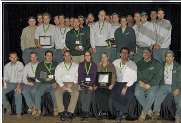
Congratulations, Clintar London!

Clintar Landscape Management is pleased to announce that our London franchise was honored with the 2009 Franchise of the Year Award at our recent Annual Conference. This is the seventh time our London franchise has received this award! The Franchise of the Year Award recognizes top-quality performance in Customer Service, Health and Safety, Human Resources and a host of other industry standards.