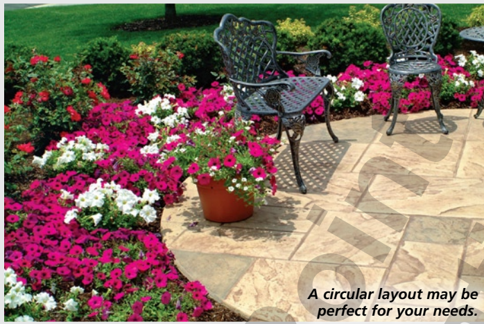
A circular layout may be perfect for your needs.

Patios make escaping to the great outdoors easy, since all you have to do is step outside!